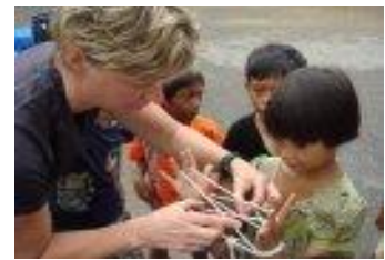
Helping the healing process