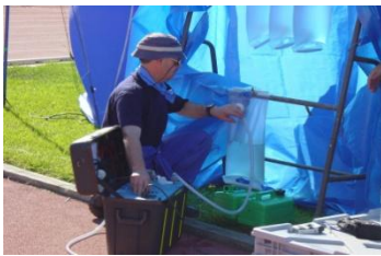
Purifying a bulk supply of water